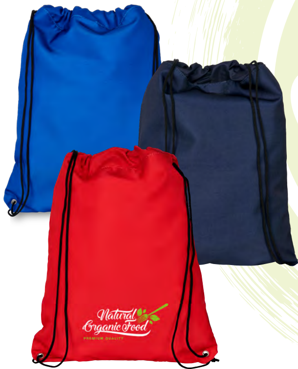
120461 ORIOLE RPET DRAWSTRING BAG