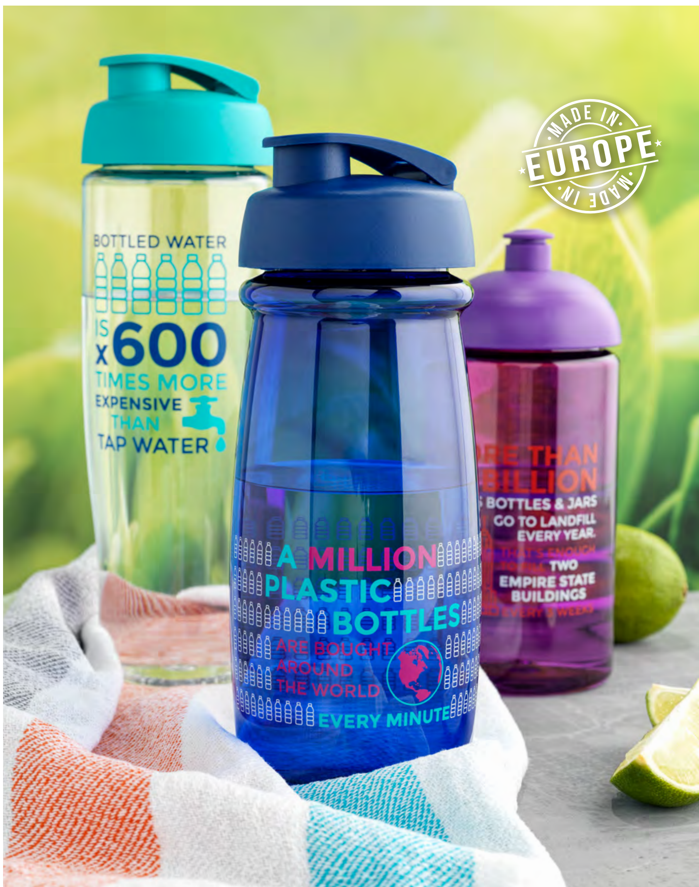
210040 H2O TEMPO® 700 ML FLIP LID SPORT BOTTLE