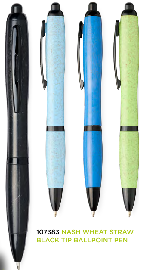
107383 NASH WHEAT STRAW BLACK TIP BALLPOINT PEN