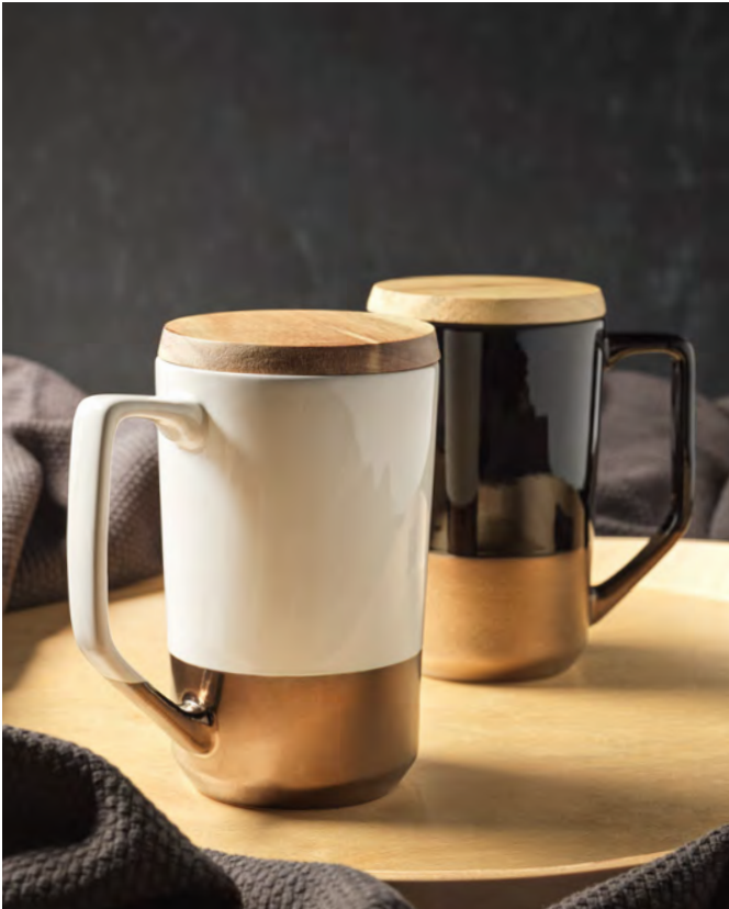
100537 TAHOE 470 ML CERAMIC MUG WITH WOODEN LID