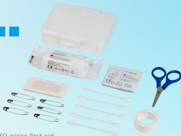
122007 Frederik 24-piece first aid plastic case