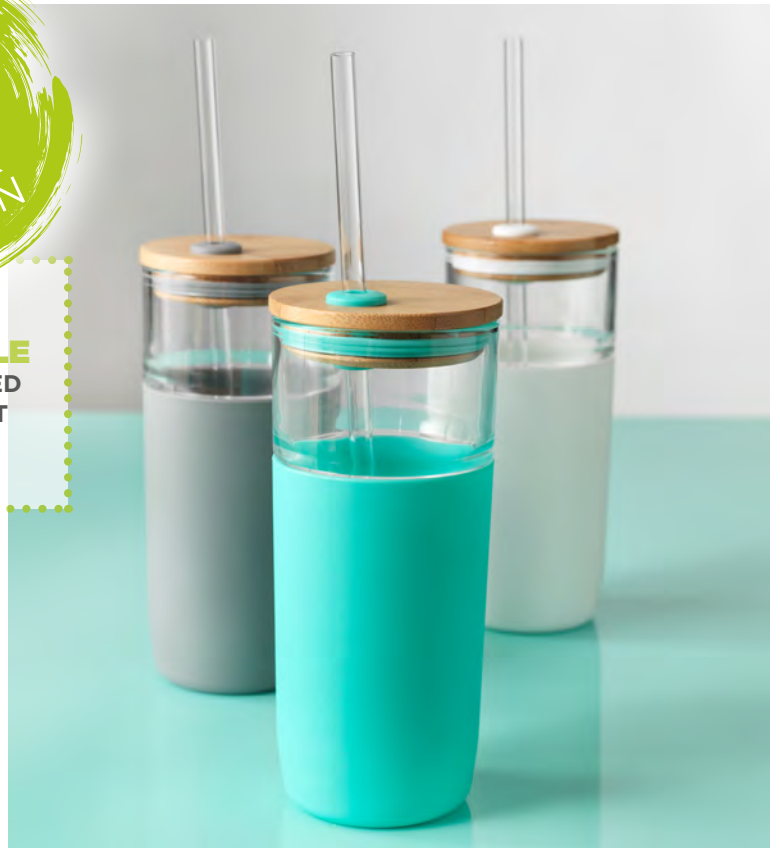
100486 ARLO 600 ML GLASS TUMBLER WITH BAMBOO LID