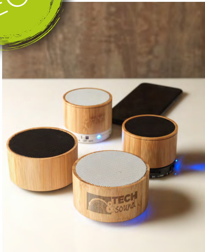
124100 COSMOS BAMBOO BLUETOOTH® SPEAKER 124101 EARTH BAMBOO BLUETOOTH® SPEAKER