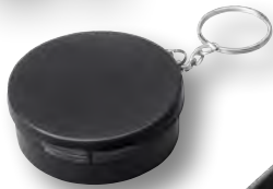
100573 RHINE REUSABLE SILICONE STRAW KEY- CHAIN