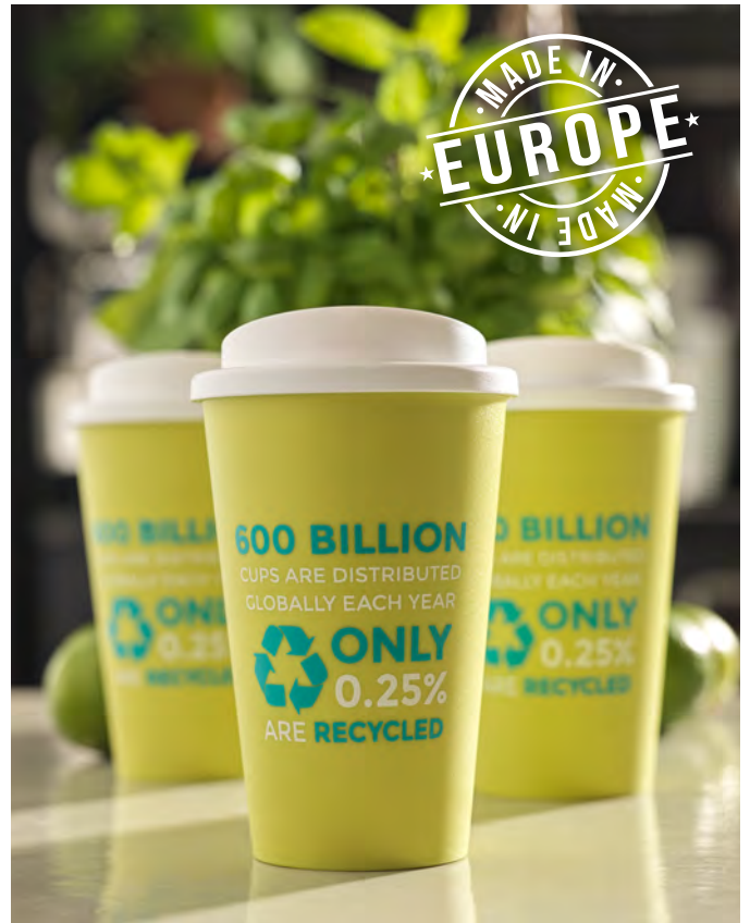
210001 AMERICANO® 350 ML INSULATED TUMBLER