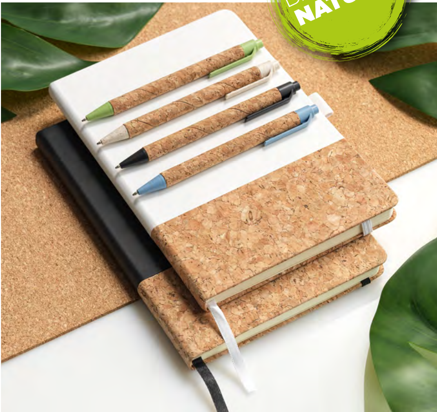
107385 MIDAR CORK AND WHEAT STRAW BALLPOINT PEN