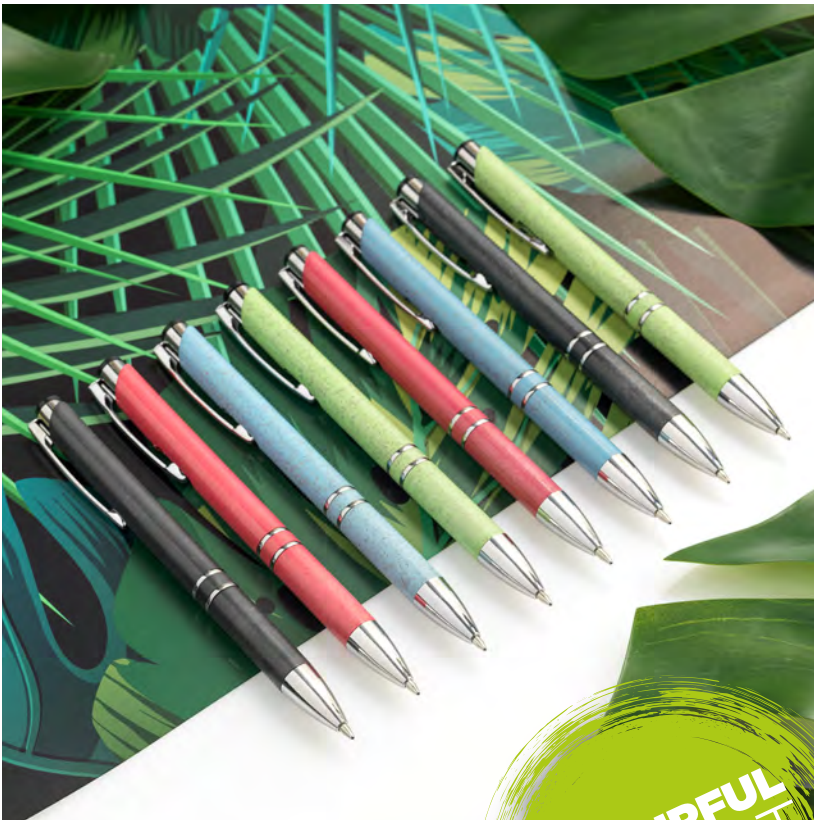
107382 MONETA WHEAT STRAW BALLPOINT PEN