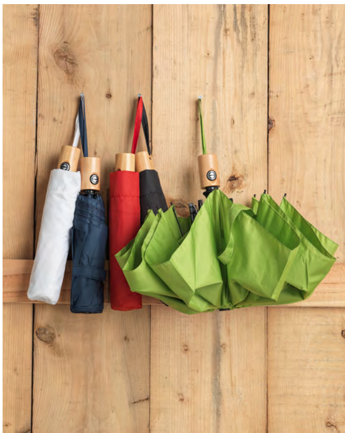
109143 RPET FOLDING UMBRELLA