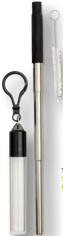
100586 ZEYA REUSABLE STAINLESS STEEL STRAW KEYCHAIN

MOST GLASS IS 100% RECYCLABLE AND CAN BE RECYCLED ENDLESSLY WITHOUT LOSS IN QUALITY OR PURITY