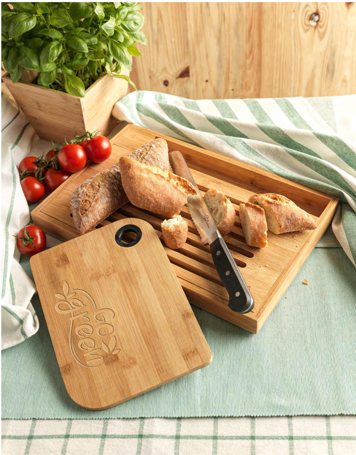
112873 MAIN WOODEN CUTTING BOARD