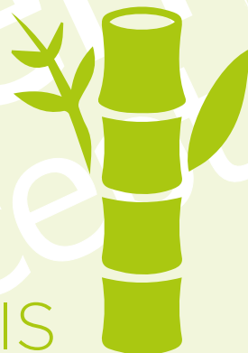
124007 WOODEN BLUETOOTH® SPEAKER WITH WIRELESS CHARGING PAD

BAMBOO IS BIODEGRADABLE AND CAN BE COMPOSED