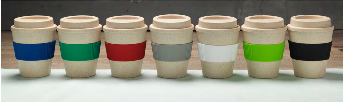
100576 OKA 350ML WHEAT STRAW TUMBLER