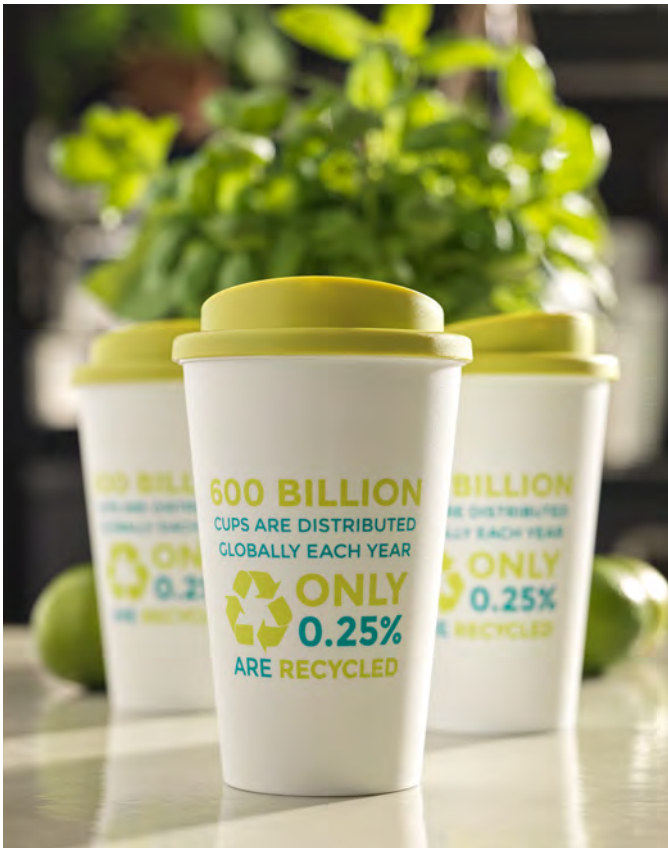
210001 AMERICANO® 350 ML INSULATED TUMBLER