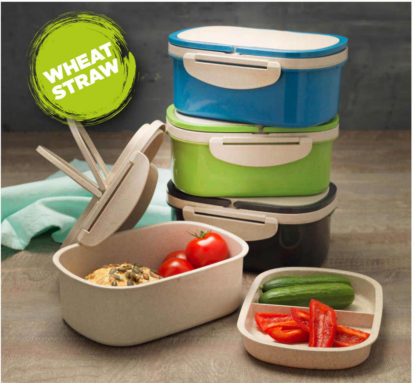
112994 CRAVE WHEAT STRAW LUNCHBOX