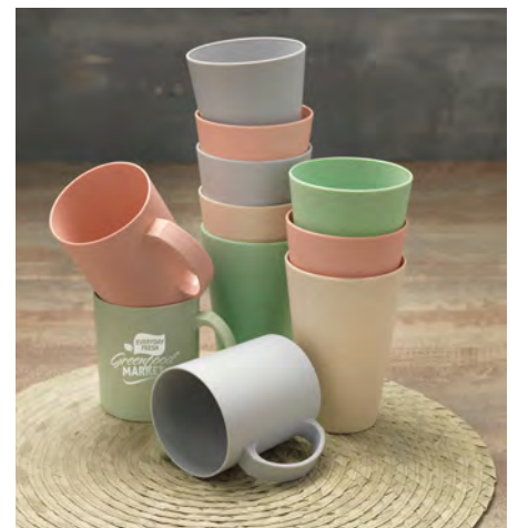
100615 GILA 430ML WHEAT STRAW TUMBLER