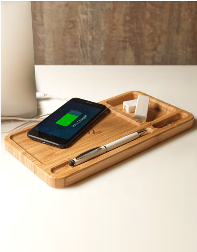
124102 FRAME WIRELESS CHARGING DESK ORGANISER