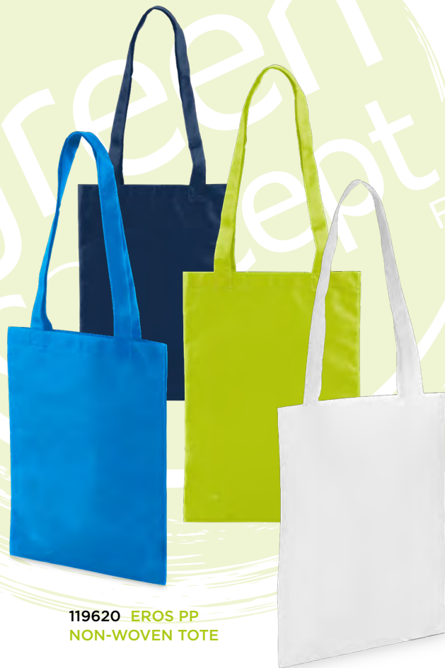
119620 EROS PP NON-WOVEN TOTE