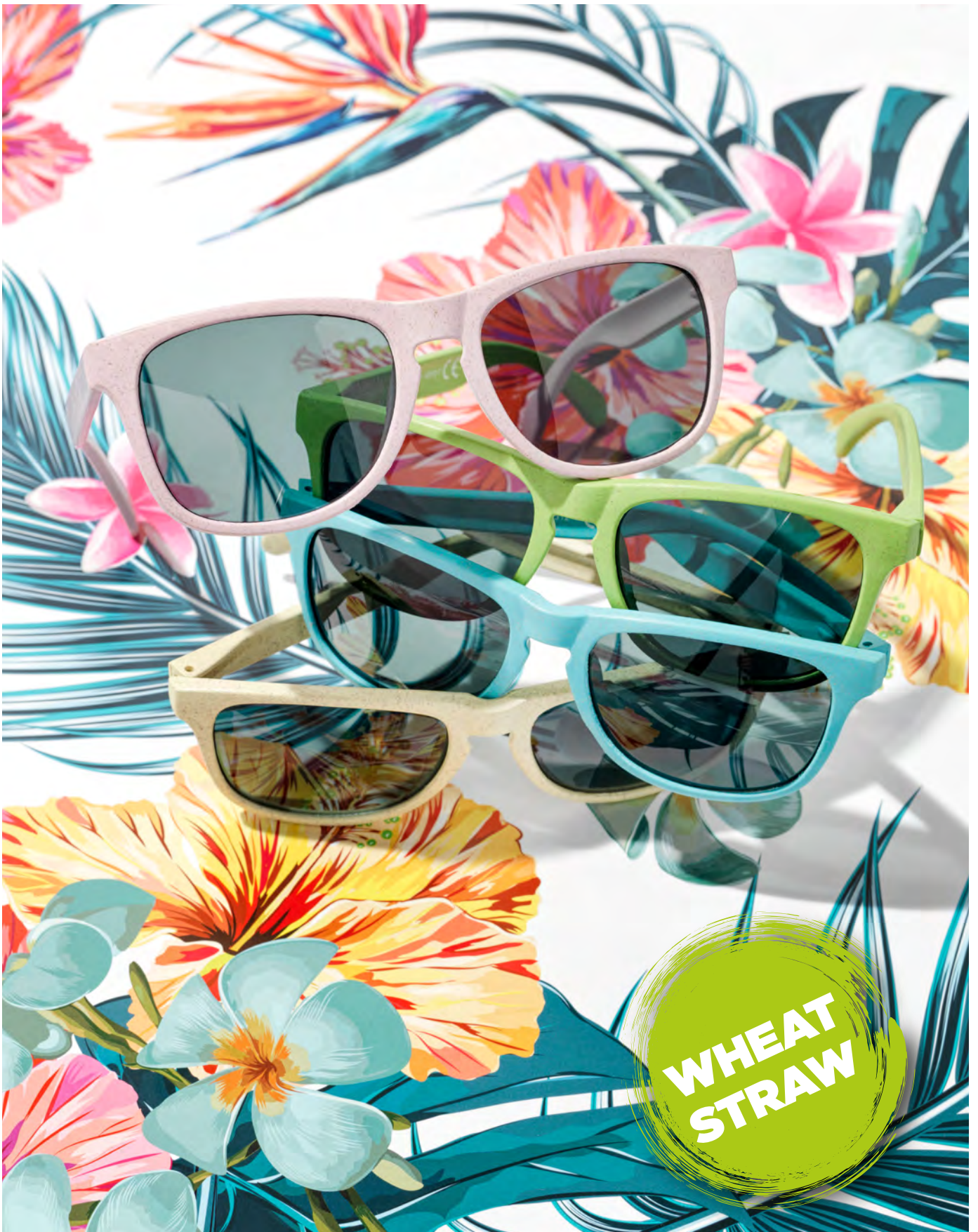
101001 RONGO WHEAT STRAW SUNGLASSES