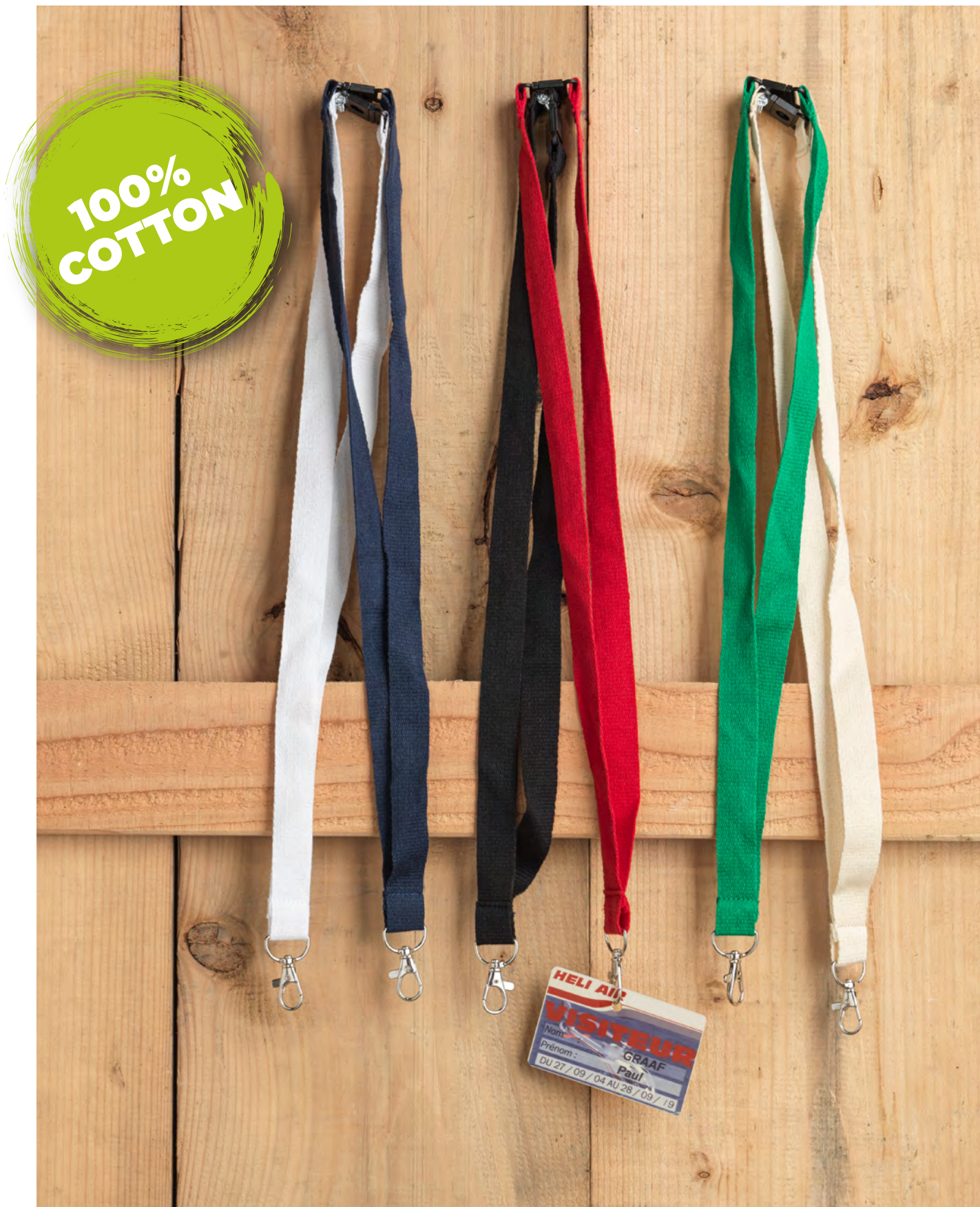
102512 DYLAN COTTON LANYARD WITH SAFETY CLIP