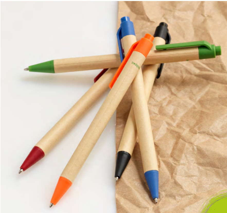
107384 BERKAN RECYCLED CARTON AND CORN BALLPOINT PEN