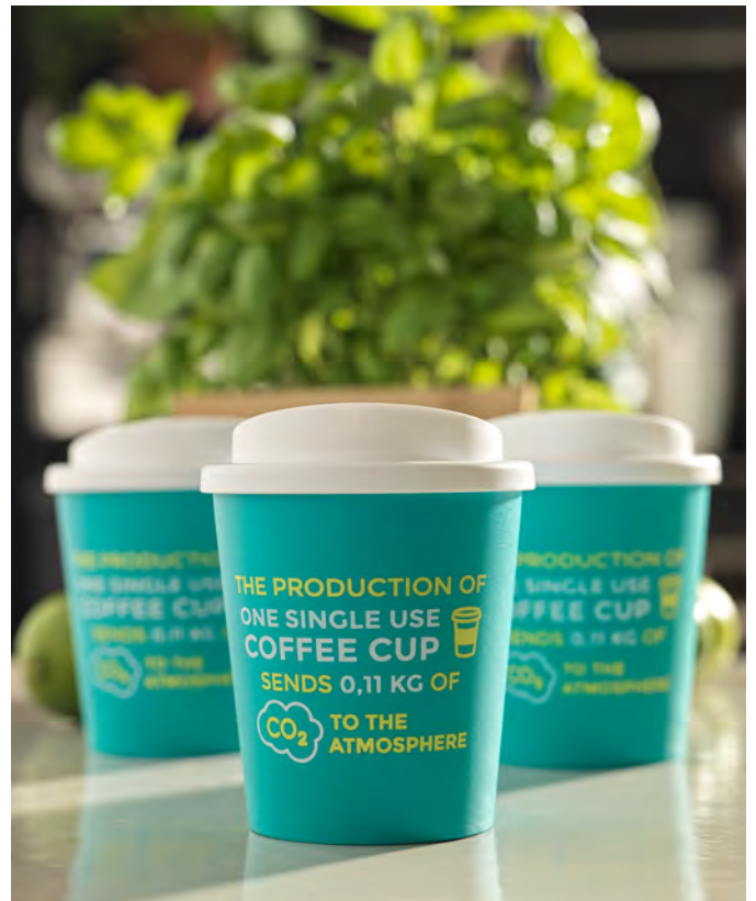
210092 AMERICANO® ESPRESSO 250 ML INSULATED TUMBLER