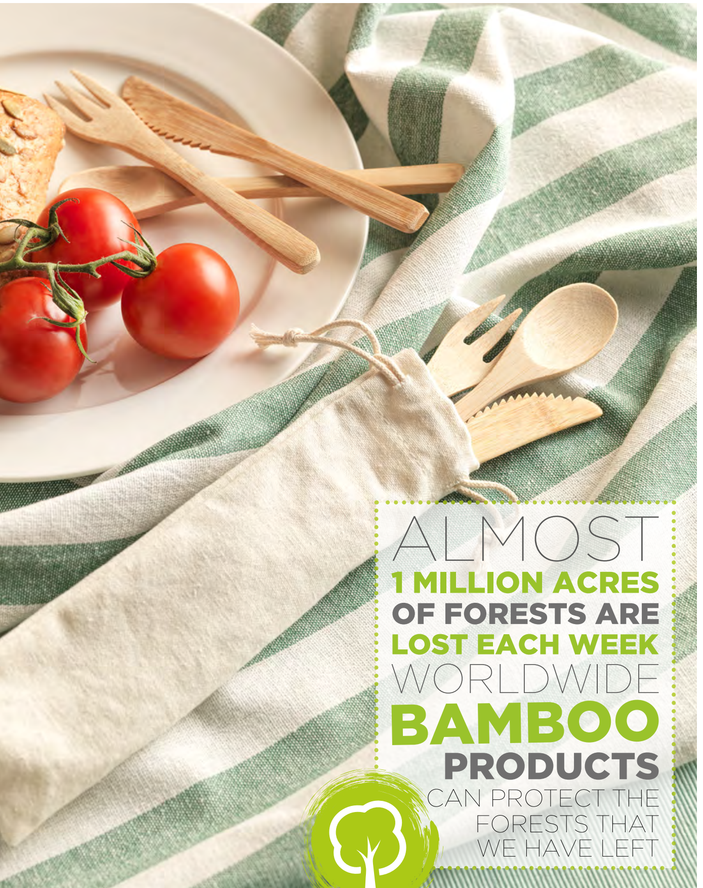
112995 CELUK BAMBOO CUTLERY SET