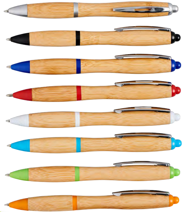
107378 NASH BAMBOO BALLPOINT PEN