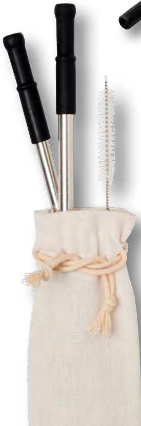
100574 LENA REUSABLE STAINLESS STRAW SET