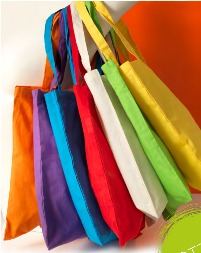
120181 MADRAS 140 G/M 2 COTTON TOTE