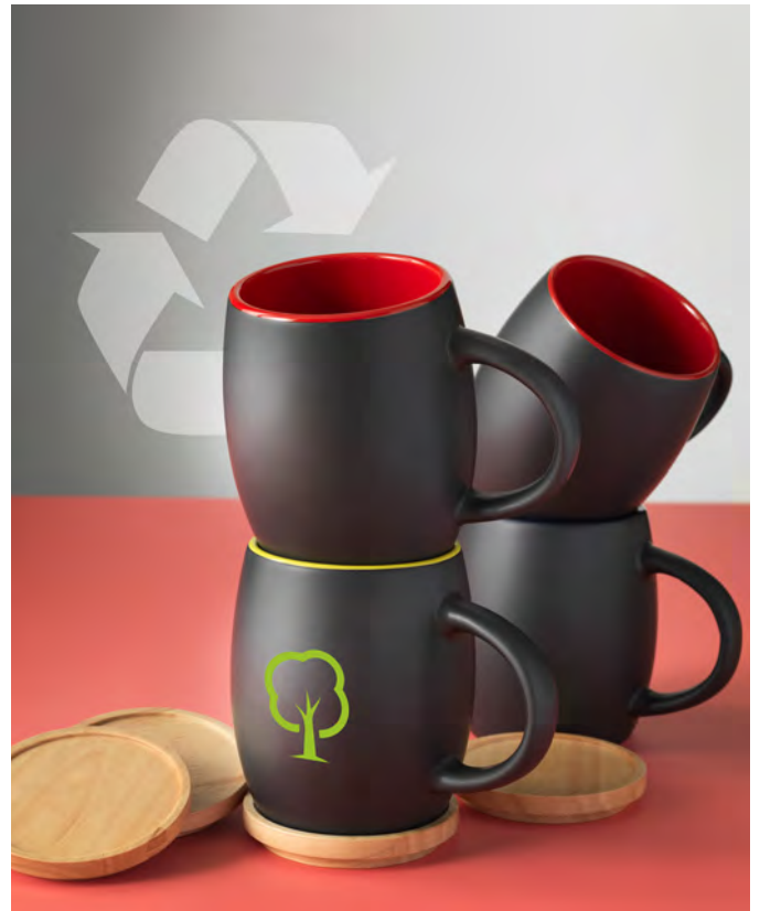
100466 HEARTH 400 ML CERAMIC MUG WITH WOODEN LID/COASTER