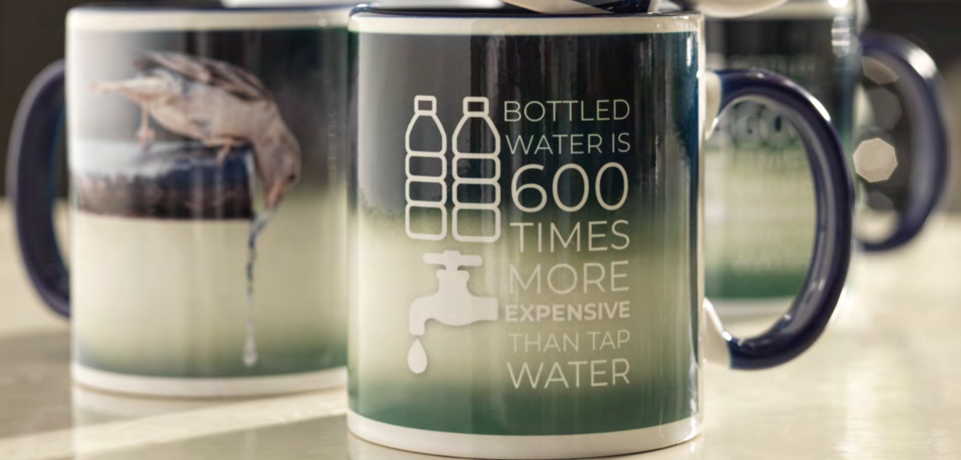
100377 PIX 330 ML CERAMIC SUBLIMATION MUG