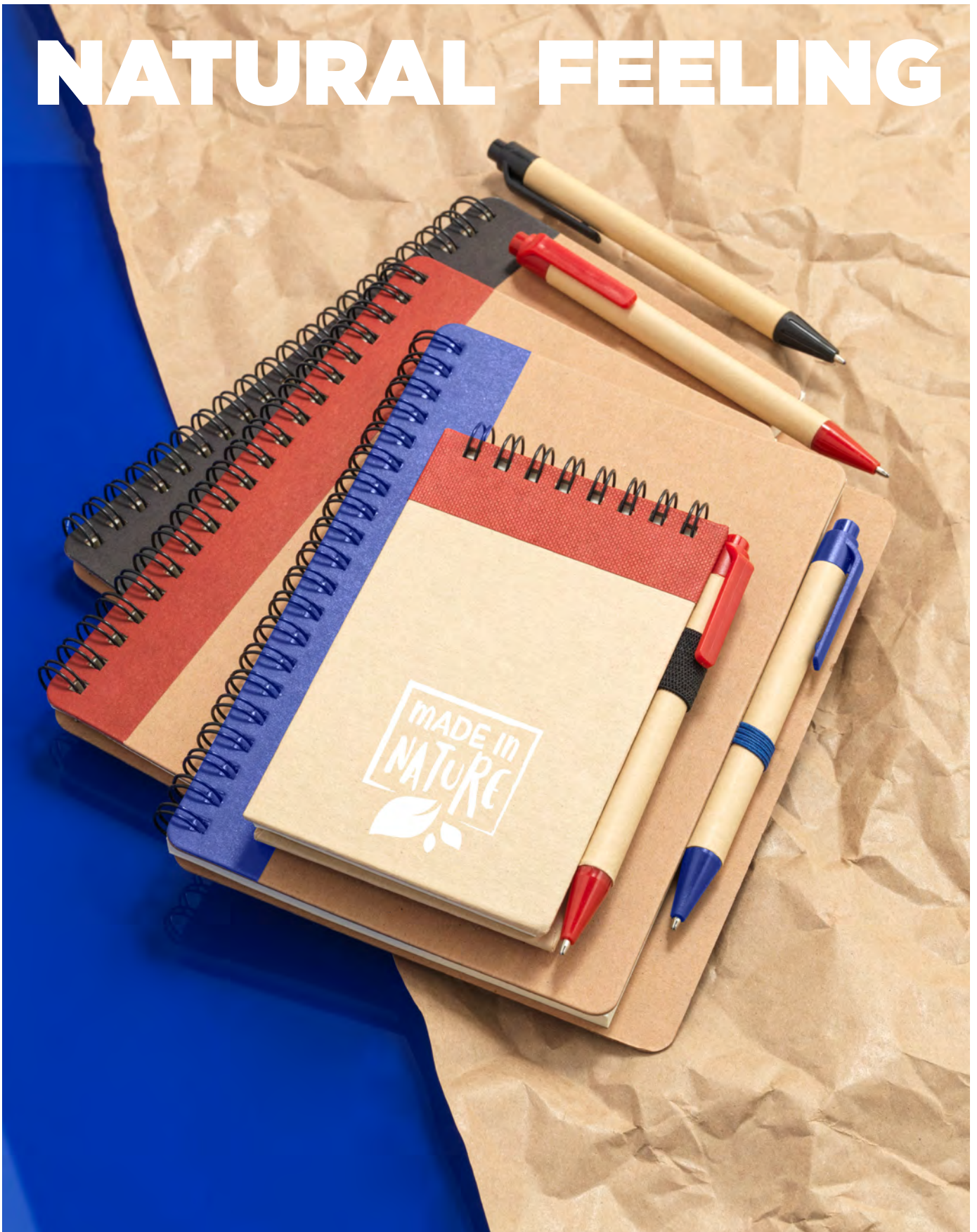
106268 PRIESTLY RECYCLED NOTEBOOK WITH PEN