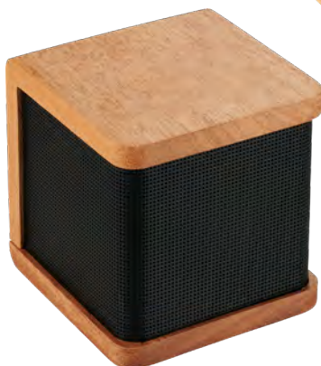
108304 SENECA WOODEN BLUETOOTH® SPEAKER