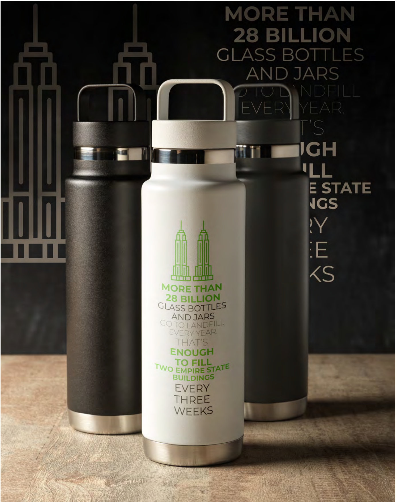
100590 COLTON 600 ML COPPER VACUUM INSULATED SPORT BOTTLE