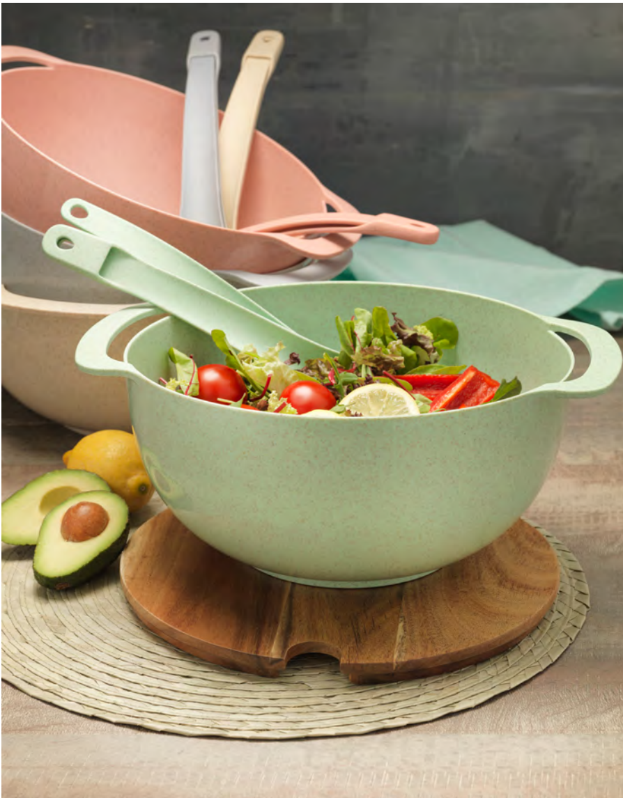
112993 LUCHA WHEAT STRAW SALAD BOWL WITH SERVERS