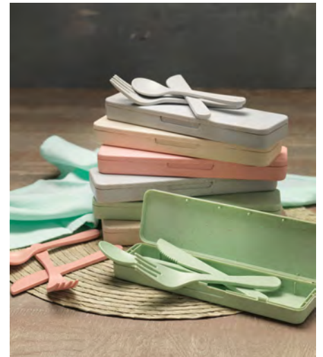
112996 BAMBERG BAMBOO FIBER CUTLERY SET