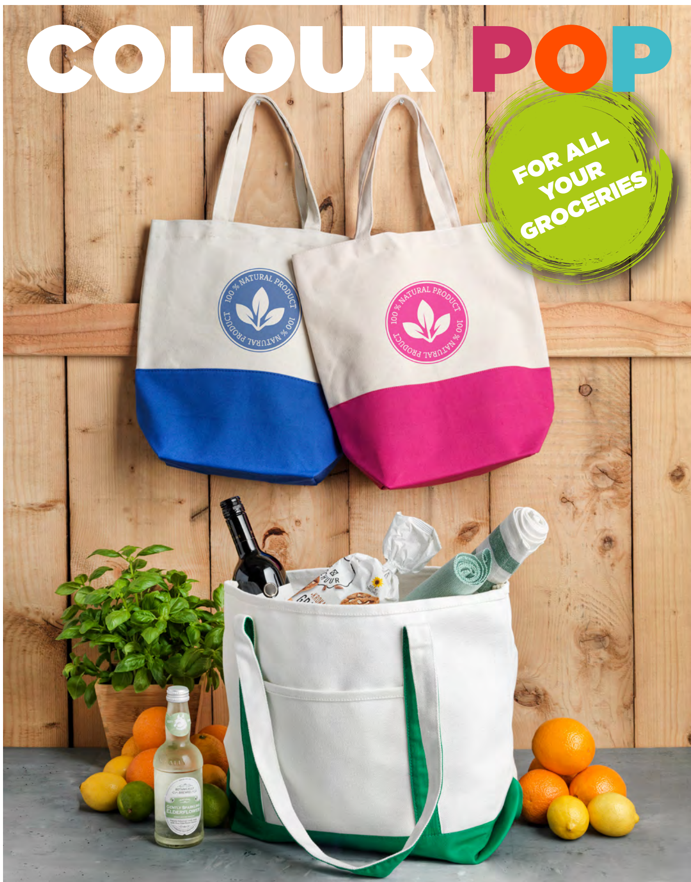
120258 COLOUR POP 284 G/M 2 COTTON TOTE