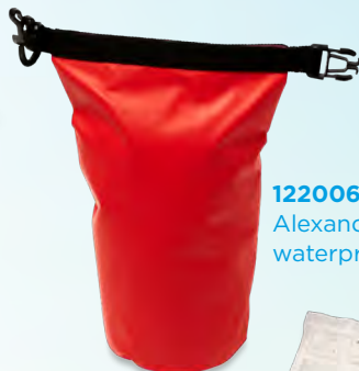
122006 Alexander 30-piece first aid waterproof bag