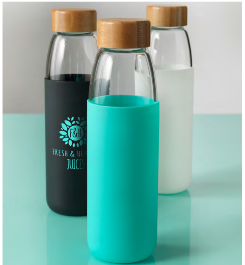
100550 KAI 540 ML GLASS SPORT BOTTLE WITH WOOD LID