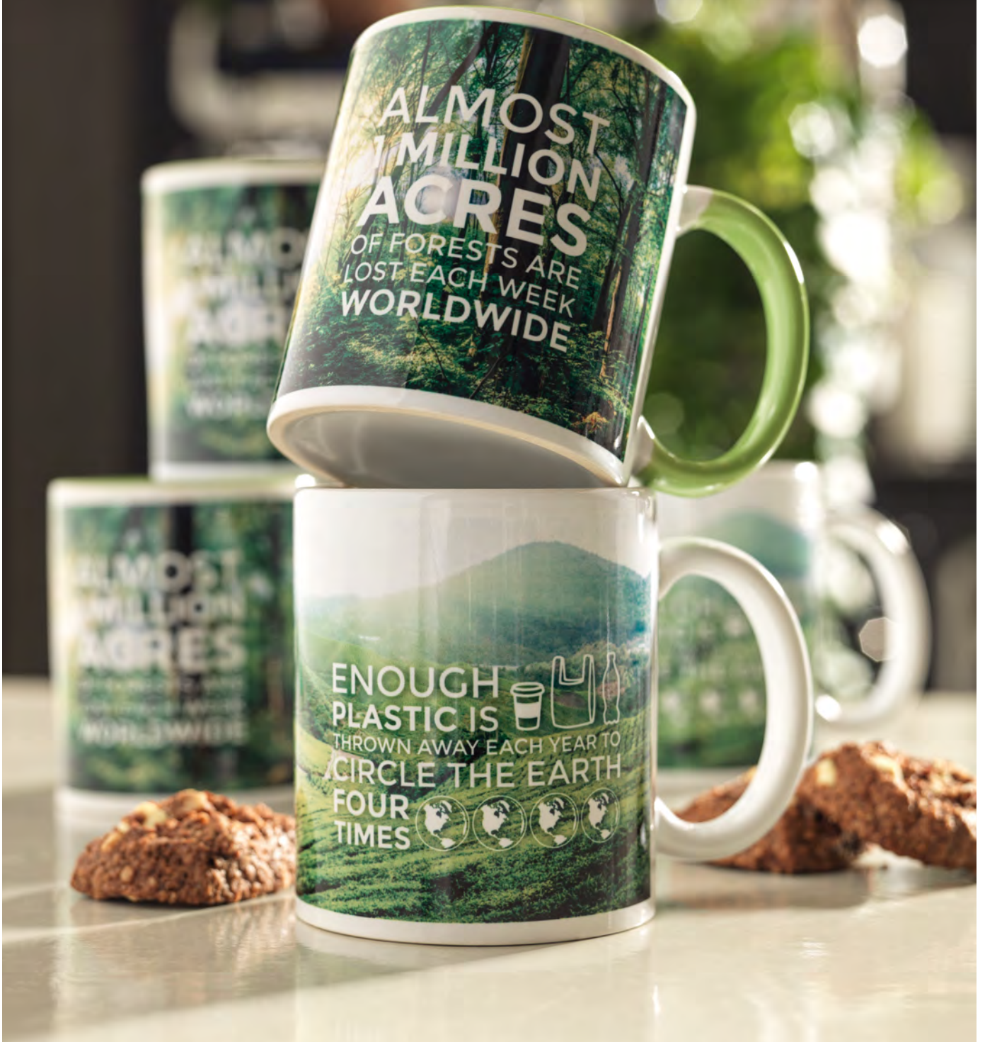
100377 PIX 330 ML CERAMIC SUBLIMATION MUG