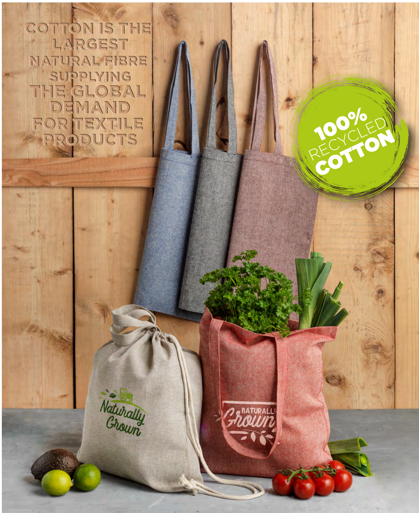
120459 PHEEBS 150 G/M 2 RECYCLED COTTON DRAWSTRING BAG