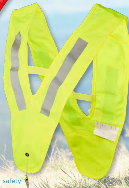
122015 Nikolai v-shaped safety vest for kids