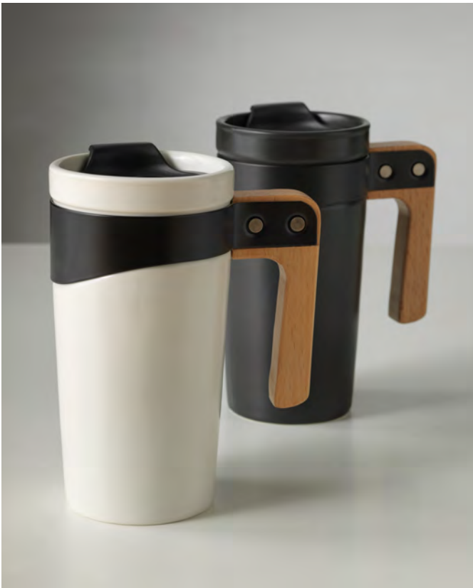
100430 GROTTO 475 ML CERAMIC MUG