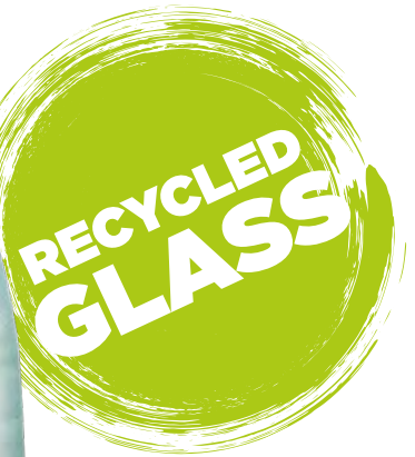
112691 RECYCLED CARAFE