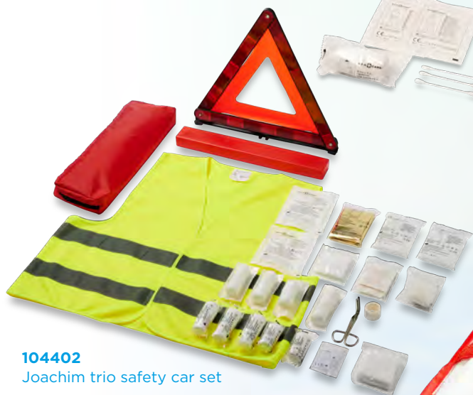
104402 Joachim trio safety car set