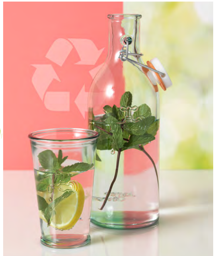
112271 RECYCLED CARAFE WITH GLASS