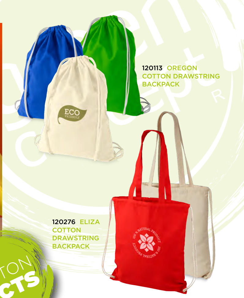
120113 OREGON COTTON DRAWSTRING BACKPACK