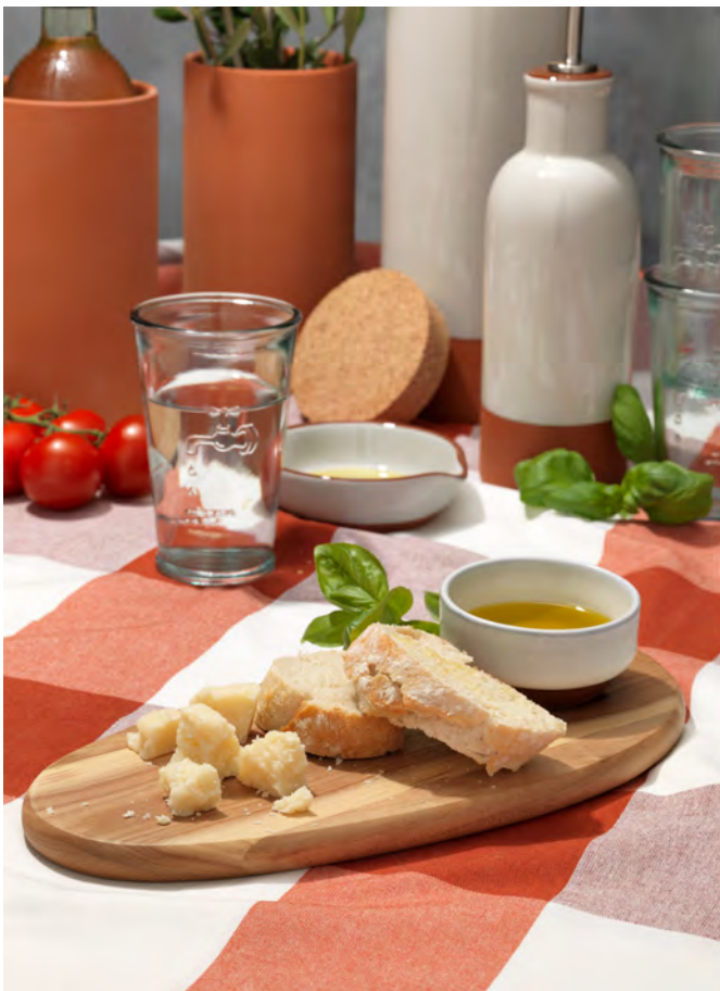
112974 BOLTON BRUSCHETTA SERVING BOARD