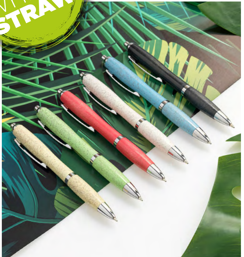
107379 NASH WHEAT STRAW CHROME TIP BALLPOINT PEN

WHEAT STRAW IS THE LEFT OVER STALK AFTER WHEAT GRAINS ARE HARVESTED, WHICH REDUCES THE AMOUNT OF PLASTIC USED BY AROUND 50%