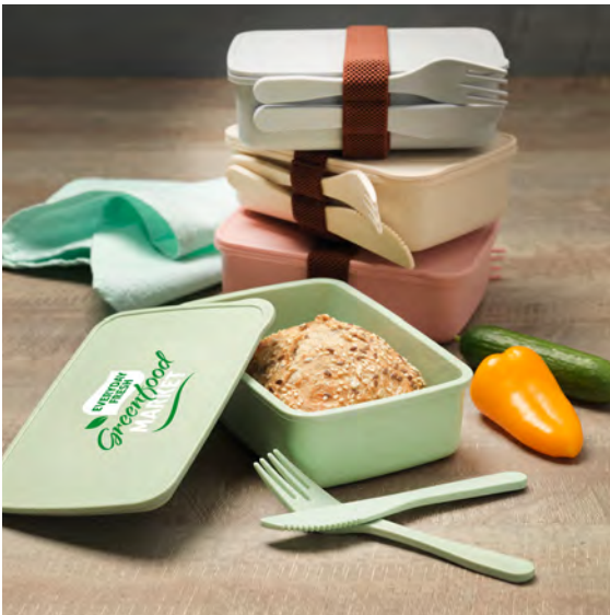
112986 BAMBERG BAMBOO FIBER LUNCHBOX