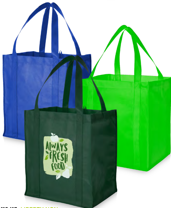
119413 LIBERTY NON WOVEN TOTE