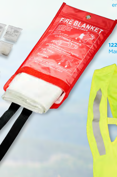
122003 Margrethe emergency fire blanket