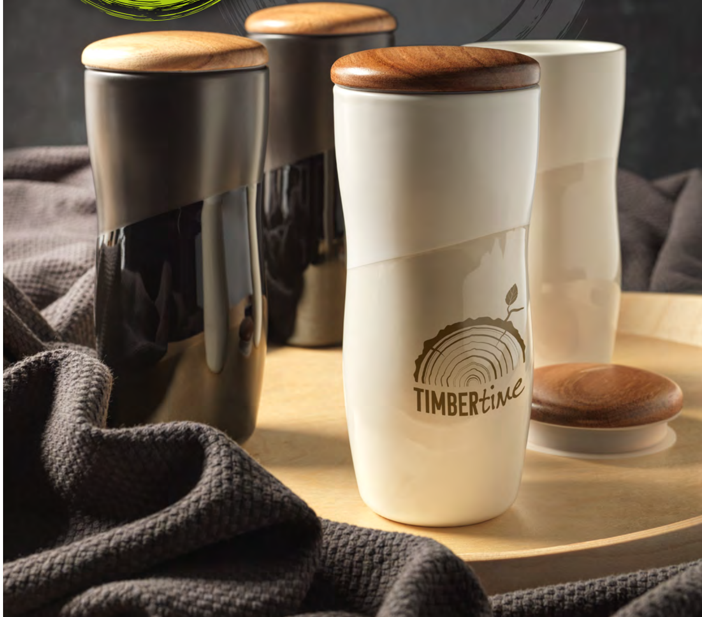
100592 RENO 370 ML DOUBLE-WALLED CERAMIC TUMBLER