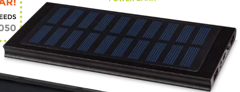
123688 STELLAR 8000MAH SOLAR POWER BANK

THE WHOLE WORLD COULD GET ALL THE POWER IT NEEDS FROM RENEWABLE RESOURCES BY 2050