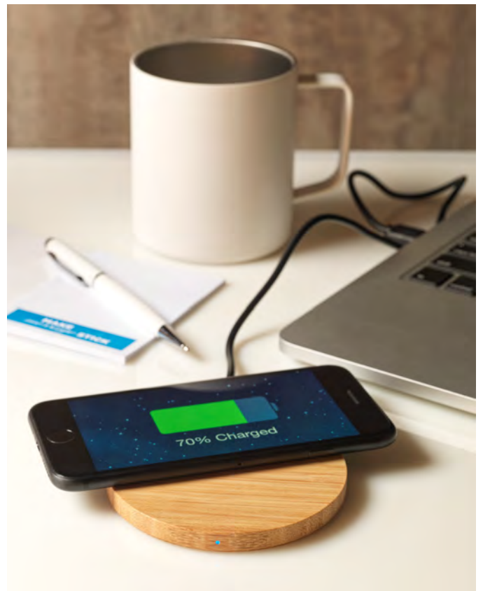
124105 ESSENCE BAMBOO WIRELESS CHARGING PAD