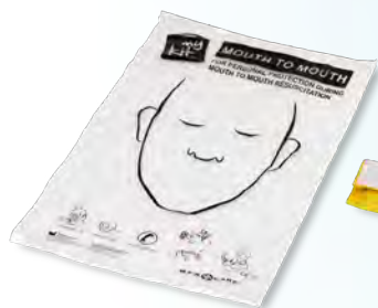
122010 Henrik mouth-to-mouth shield in polyester pouch