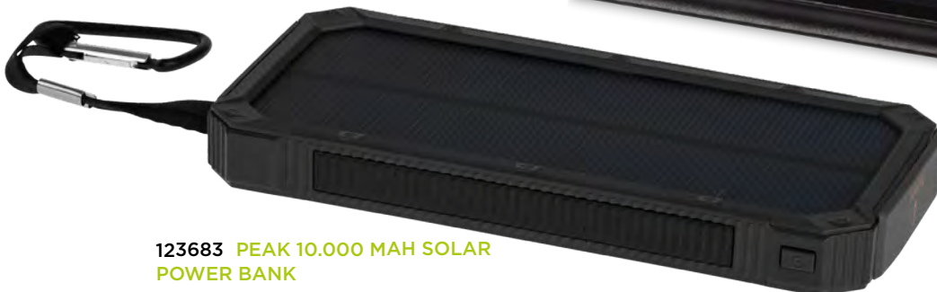
123683 PEAK 10.000 MAH SOLAR POWER BANK