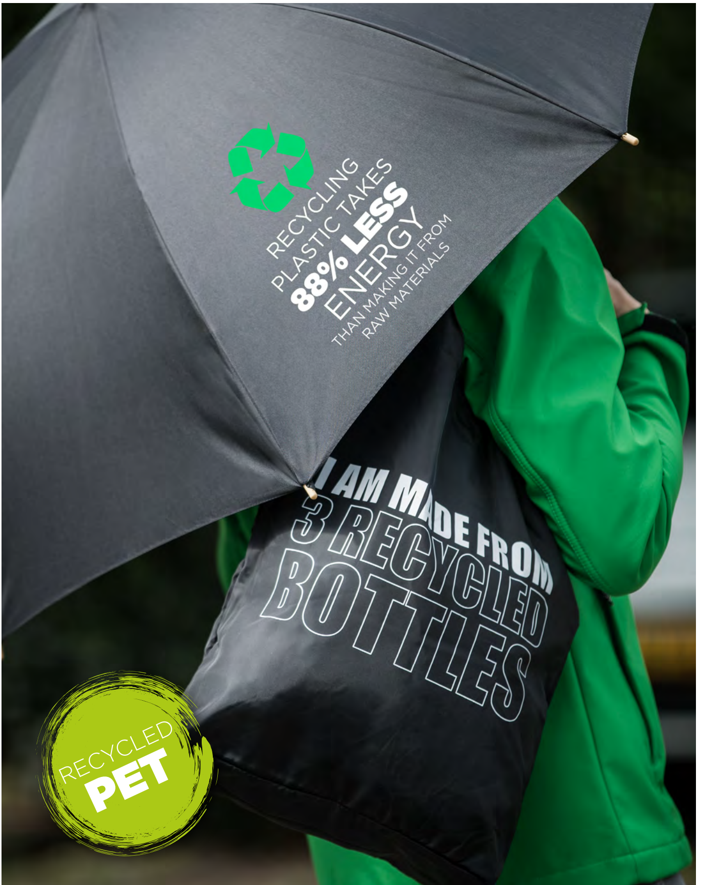
109400 RPET STRAIGHT UMBRELLA