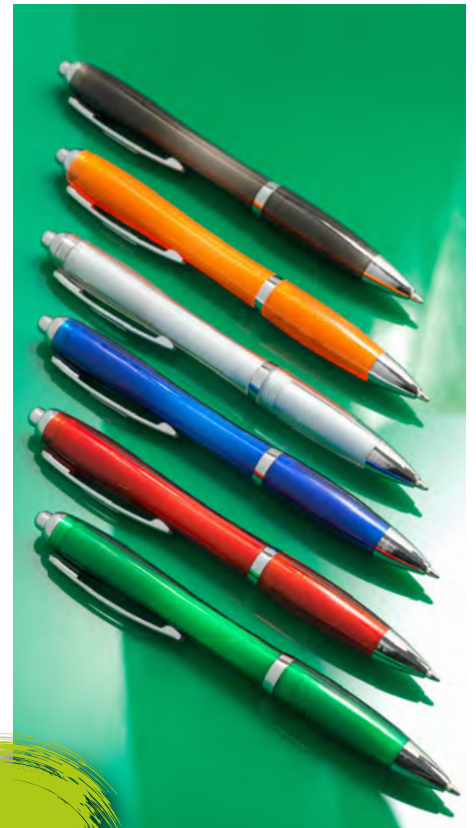
107377 NASH RECYCLED PET BALLPOINT PEN