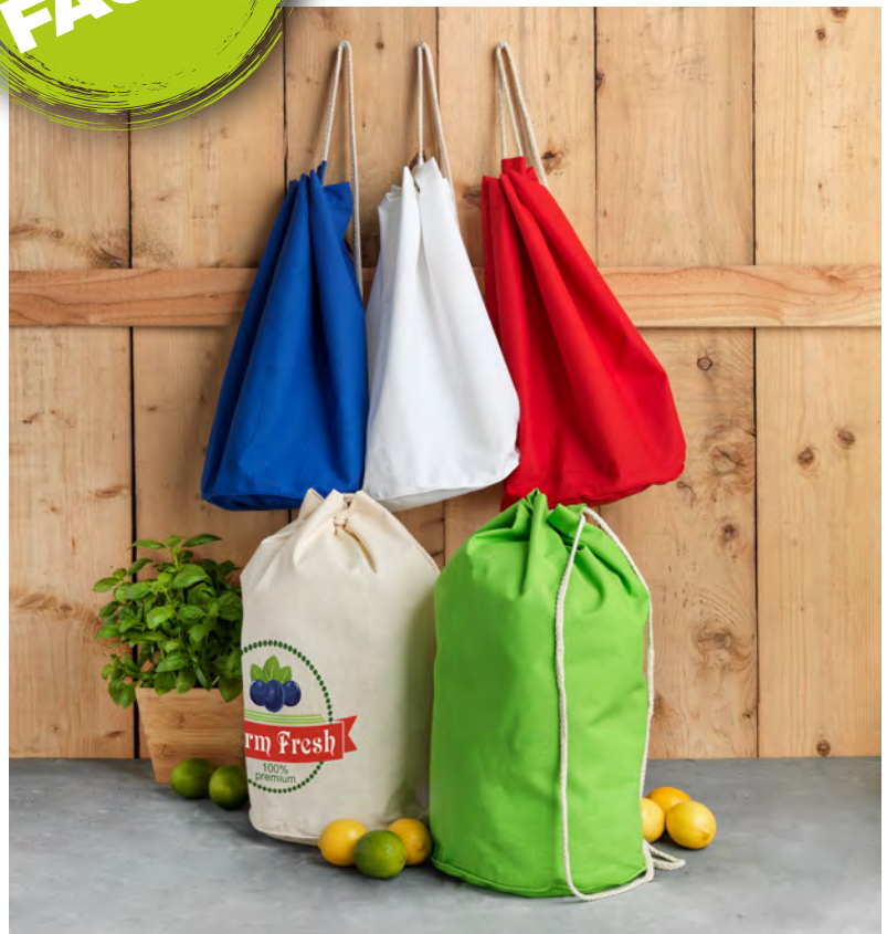
120111 MISSOURI COTTON SAILOR BAG

ROUGHLY 1.6 POUNDS OF OTHER USEFUL PRODUCTS BEING CREATED