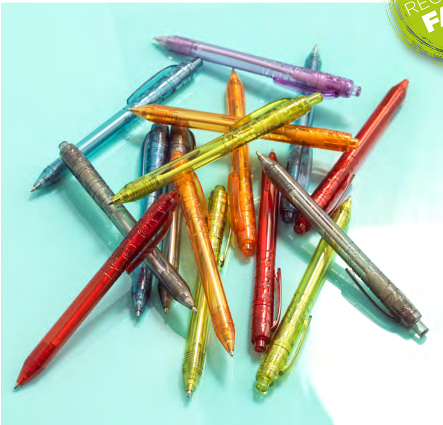
106578 VANCOUVER RECYCLED PET BALLPOINT PEN