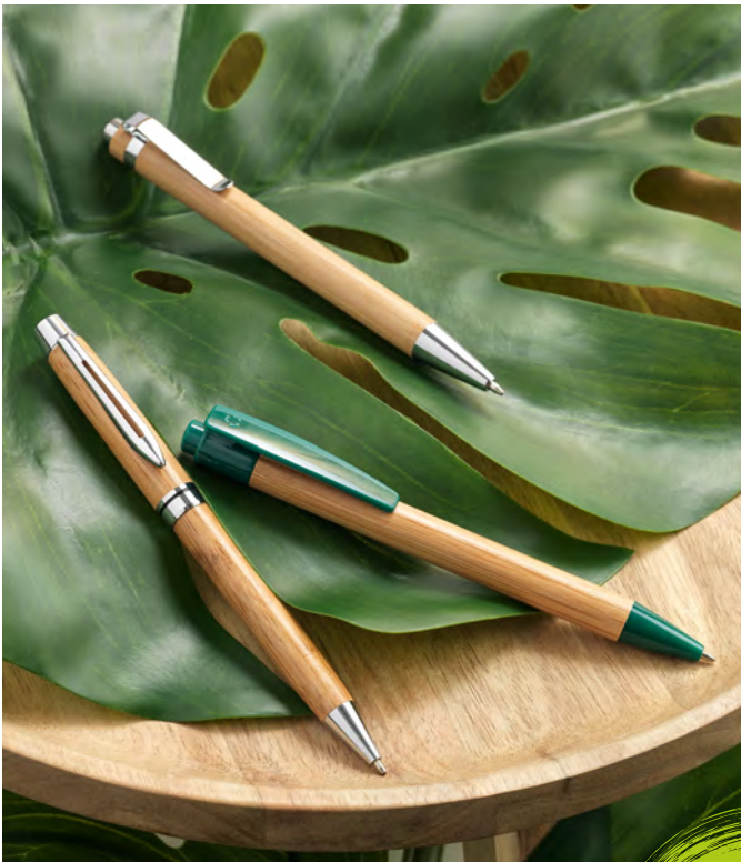
106282 JAKARTA BAMBOO PEN 106322 BORNEO BAMBOO PEN 106212 CELUK BAMBOO BALLPOINT PEN