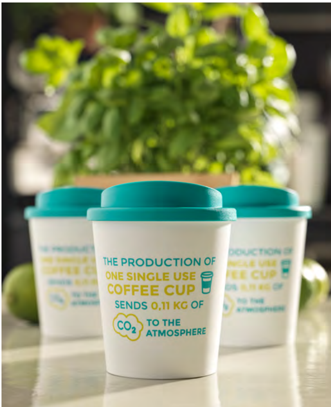
210092 AMERICANO® ESPRESSO 250 ML INSULATED TUMBLER